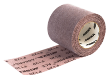
Mirka Abranet Abrasive Roll

For more information, contact: info@bestabrasives.com.au or phone 02 8036 8478