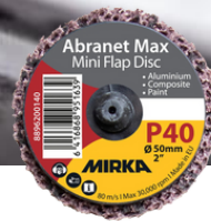
Abranet Max flap disc